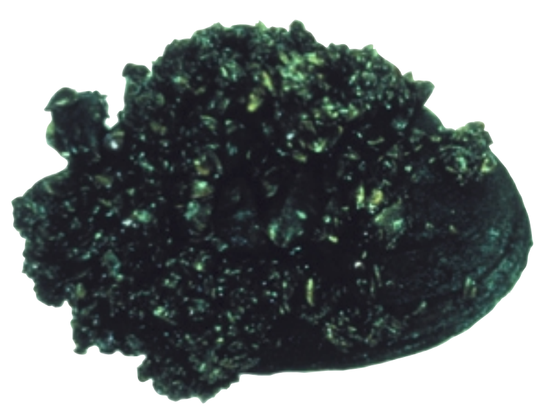
Figure 3. Zebra Mussels Attached to Native Mussel (Don Schloesser)

Habitat loss is the primary cause for the decline in native mussels. However, zebra mussels have added a new threat. Zebra mussels often attach around the gape of native mussels, preventing them from opening and closing their valves (see Figure 3). They may even cover the native mussel's entire surface and then begin settling on top of each other. (Mackie, 1989).