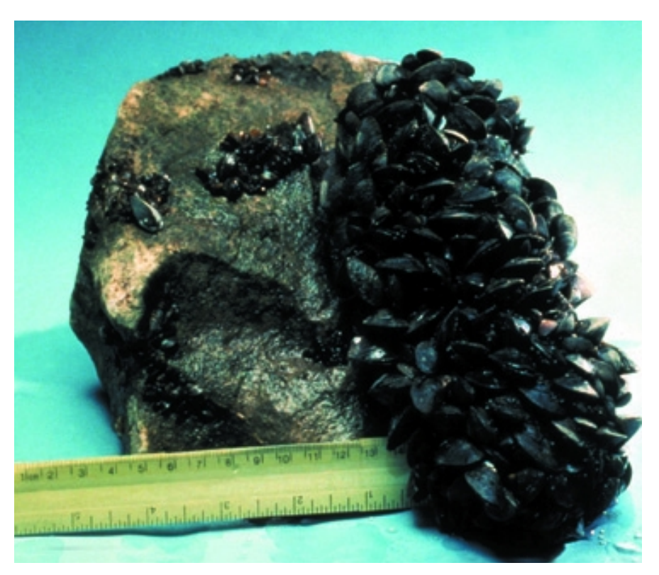
Figure 1. Zebra Mussels (Don Schloesser)

Zebra mussels vary morphologically, hence the species name "polymorpha" meaning many forms. Although most have jagged lateral black or brown stripes, some have longitudinal bands while others are totally cream or black (Marsden 1992). They can grow up to 2 inches in length but most are under an inch (see Figure 1).